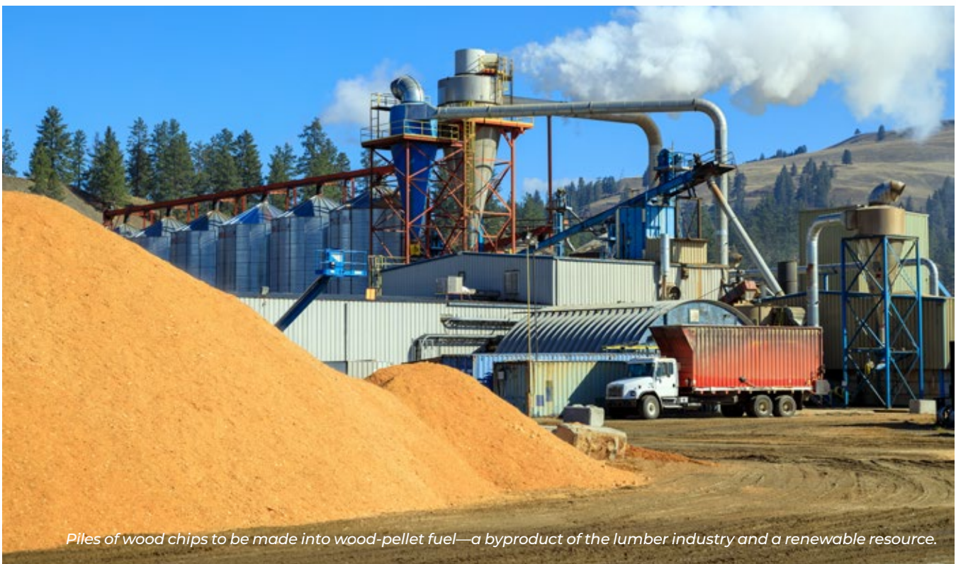
Piles of wood chips to be made into wood-pellet fuel—a byproduct of the lumber industry and a renewable resource.

Lastly, some First Nations have expressed interest in leading clean fuel projects. For example, the Siksika Nation is working with Reconciliation Energy Transition Inc. to build a sustainable aviation fuel facility to supply Calgary International Airport (Tuttle 2022). However, direct Indigenous ownership of projects, along with equity partnerships, is a challenge for Indigenous communities to pursue without government action because of the legacy and ongoing impacts of colonialism. In particular, the Indian Act continues to restrict Indigenous Peoples from owning land and conducting commerce meaning that Indigenous governments are unable to use their assets as collateral. As a result, Indigenous Peoples are classified as “high-risk” borrowers who are unable to secure loans at standard commercial interest rates (Von der Porten and Podlasly 2021). Given that equity partnerships and direct Indigenous ownership provides the greatest benefits for Indigenous communities by maximizing long-term wealth, but also entails greater financial risk, governments have a clear role to play in mitigating this policy failure (Garcha 2022). Governments can address these concerns by providing loan guarantees, as is currently done through the Alberta Indigenous Opportunities Corporation and the Ontario Aboriginal Loan Guarantee Program, and/or with a revolving loan fund (Calla 2021; Gale and Hyder 2023).