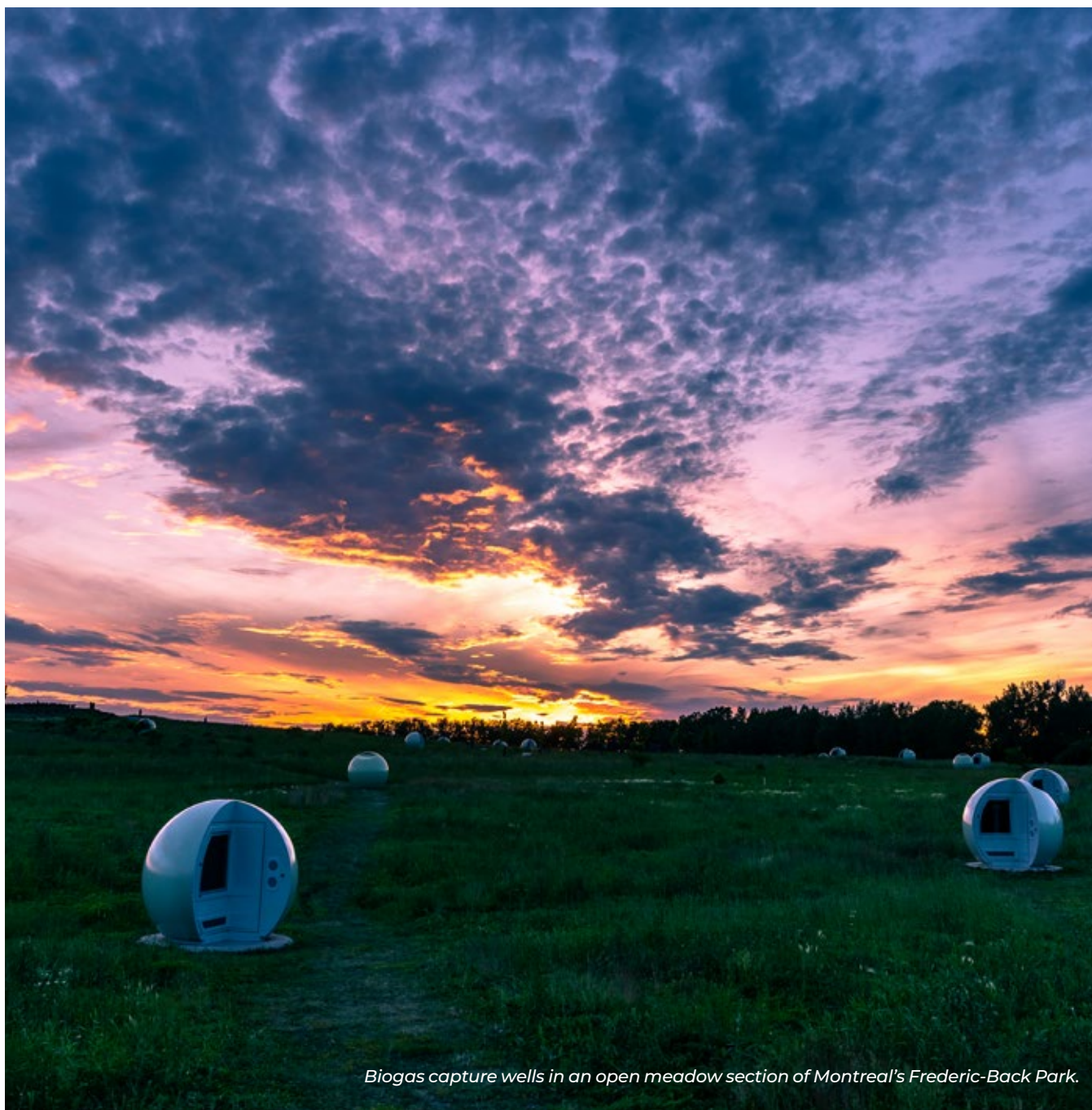
Biogas capture wells in an open meadow section of Montreal's Frederic-Back Park.

Yet, first-of-kind clean fuel projects also face other barriers—market and policy failures—that could prompt government intervention. Market failures represent circumstances where markets alone do not provide incentives to deliver outcomes with overall benefits to society. Similarly, problems with existing policies can create barriers and perverse incentives. In these cases, public policy can provide net benefits—if designed well.